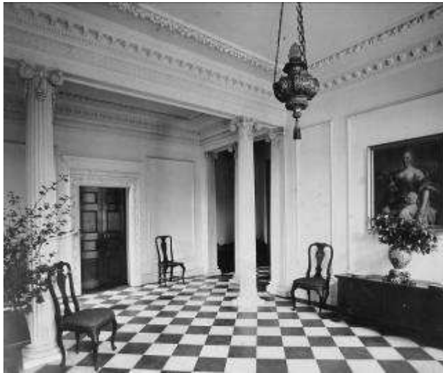
Wood End entrance hall in the 1920s