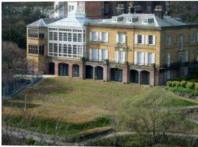
Wood End in the 21st century