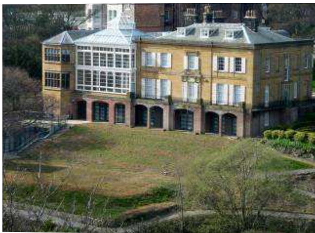
Wood End in the 21st century