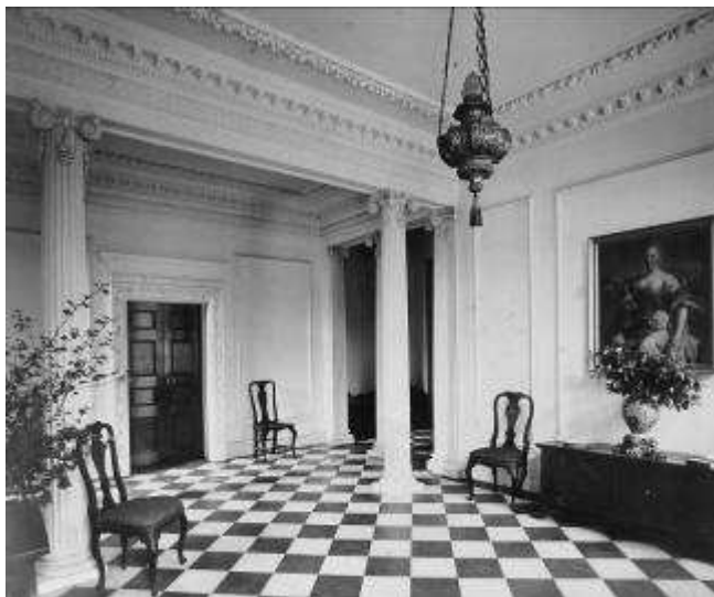
Wood End entrance hall in the 1920s

Their first child Edith was born in the house at Wood End on 7th Sept. 1887 and she was an immediate disappointment. Of the wrong gender she was not the expected heir to her father, Sir George. Failing to reflect the beauty of her mother, Lady Ida, a lifelong maternal barrier was established. Osbert was born in London on 7th December 1892 and Sacheverell was born in Scarborough on 15th Nov. 1897 to complete this fascinating "Trio"